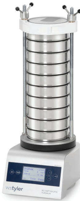
RO-TAP E PREMIUM