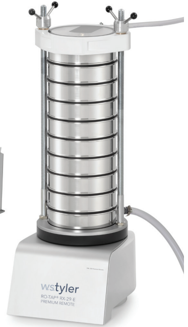
RO-TAP E PREMIUM REMOTE

The newly designed test sieve shaker stands out with its simple and quick operation. Two specific regulated amplitudes for coarse or fine material can be selected by the user. Sieving begins immediately once the timer is set and an amplitude has been selected. The Ro-Tap E is recommended as a basic machine for standard sieve analysis.