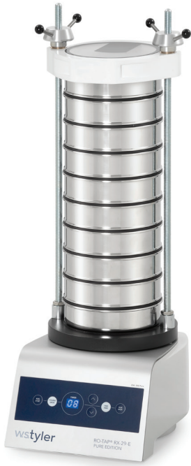
RO-TAP E PURE