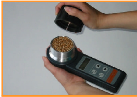
Figure 1a. Fill the measuring cell evenly to the top, ensuring the crop is level with the top of the cell. Screw on the cap and tighten until the stainless steel pressure indicator is flush with the top of the cap.