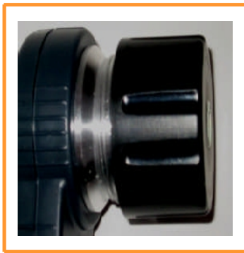
Figure 1 c

✘ Screw cap under tightened. Stainless steel indicator sunken in cap