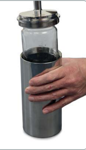
Bottle Sampler with protective Bottle Cover