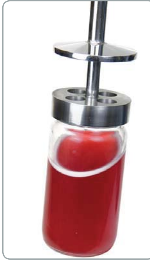
Bottle Sampler without Bottle Cover