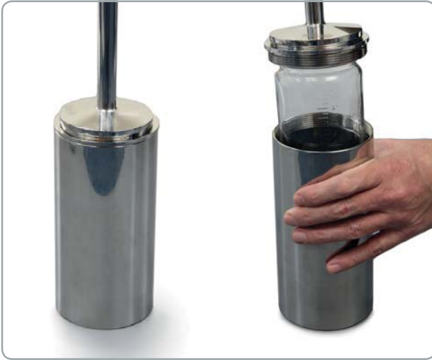
Sampler with protective cover that also helps to keep the bottle dry during sampling

Ideal for taking quick samples direct into the bottle. The sampler is available with a cover that goes over the bottle to stop the bottle from getting wet.